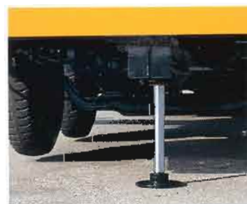
● Hydraulic front jack (option)

● A Hydraulic jack installed under the front extremity of the carrier chassis enables the crane to offer the same lifting performance in all directions. This means that there are fewer limitations caused by the orientation of the crane when it enters a site, boosts its operational range.